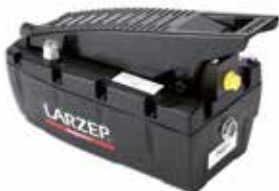
Z12107 Air Hydraulic Pump